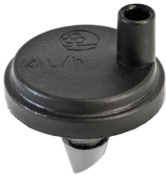
Agri Drip Classic 4 lph