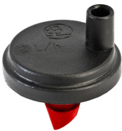
Agri Drip Classic 2 lph