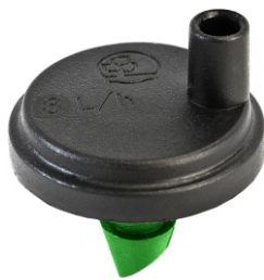
Agri Drip Classic 8 lph