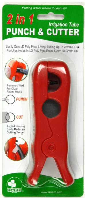
2 in 1 Punch & Cutter Retail Packaging