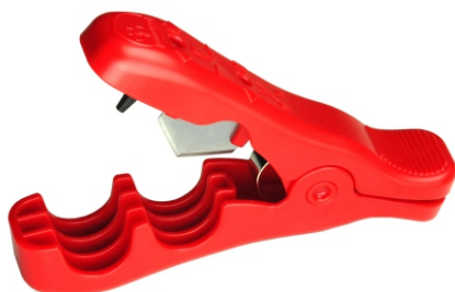
2 in 1 Punch & Cutter