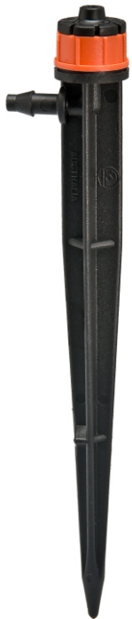
Shrubbler® 360° PC Spike with 4 mm Inlet